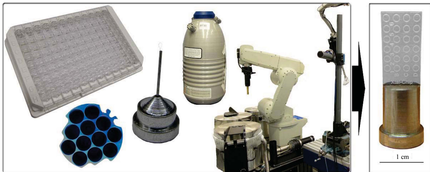
Figure 1 The X-CHIP was designed and developed as an alternative to the conventional stages of the existing crystallization to data collection process.

significant surge of developments in crystallography-aimed microtechnology, specifically the use of crystallization chips. To date, the field has been dominated by a range of microfluidic devices (Li & Ismagilov, 2010), with one of the most significant differences between them being the type of crystallization technique that they employ. Several devices have been developed and even commercialized (such as the Topaz crystallizer from Fluidigm Corp., California, USA and The Crystal Former from Microlytic Inc., Massachusetts, USA) that utilize free-interface diffusion (FID; Hansen et al. , 2002). Other chips employ nanochannels to create counter-diffusion crystallization (Hasegawa et al. , 2007; Ng et al. , 2008; Dhouib et al. , 2009) or nanodroplets that simulate batch crystallization (Zheng et al. , 2003). There are two clear parallel implications in all these devices. They are all striving to increase the efficiency of the hit-identification process and are offering the possibility of in situ X-ray analysis and, in favorable cases, diffraction data collection for structure determination (Zheng et al. , 2004; Hansen et al. , 2006; Ng et al. , 2008; May et al. , 2008; Dhouib et al. , 2009)